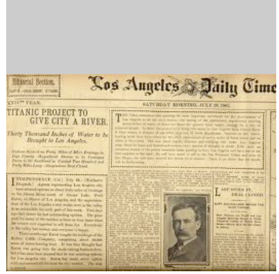
Los Angeles Times, July 29, 1905