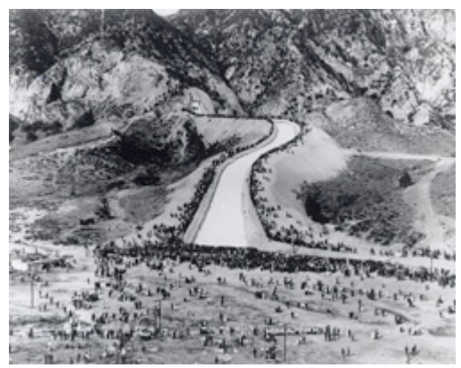
Dedication of the Aqueduct at Sylmar, November 5, 1913