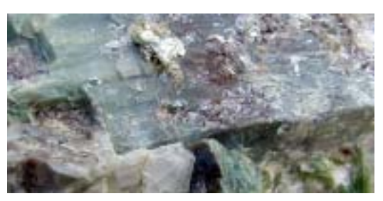
Andalusite crystal section with muscovite

The andalusite bodies frequently contain small crystals of lazulite in cavities and often small groups of pyrite crystals may be found associated with the lazulite.