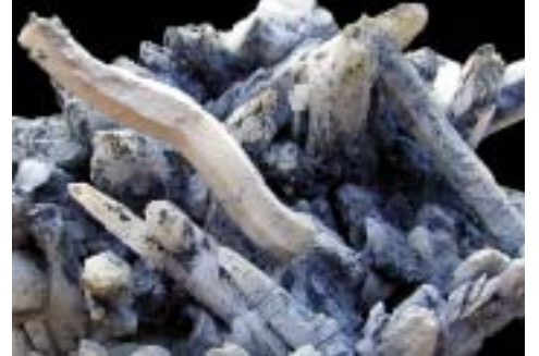
Bent Quartz dusted with rutile

Quartz is ubiquitous throughout the Champion Mine and occurs as massive bull quartz that often contains crystal lined cavities and as seams and pods in the andalusite bearing schist that encloses the main quartz body. Crystals occur in a variety of forms from typical bipyramidal prisms to crystals flattened on one pair of prism faces that have a tabular outline. Many of the crystals have a corroded surface and rounded forms. At the Vulcanus # 8 Tunnel small orange crystals were found on the surface of older white quartz specimens. Occasionally these specimens show a well-developed scepter termination. Also in this area seams and pockets in the aluminiferous schist contain quartz crystals that show a distorted form being bent into curving forms.