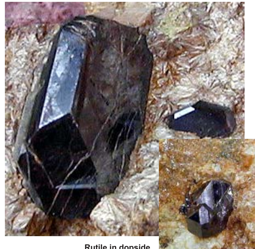
Rutile in dopside

Schorl is not common in the quartz at White Mountain. At the Vulcanus # 8 Tunnel occasional groups of quartz crystals are found with the spaces between crystal prisms containing acicular hair-like schorl crystals. This material is not common but some pockets contain a considerable amount of material.