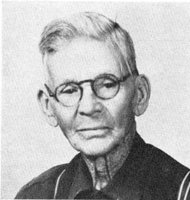
COMMUNIST BROWDER WAS LUCKIER

Overnight mail service between Lone Pine and Los Angeles was getting us no where. Thereupon this writer recently journeyed to