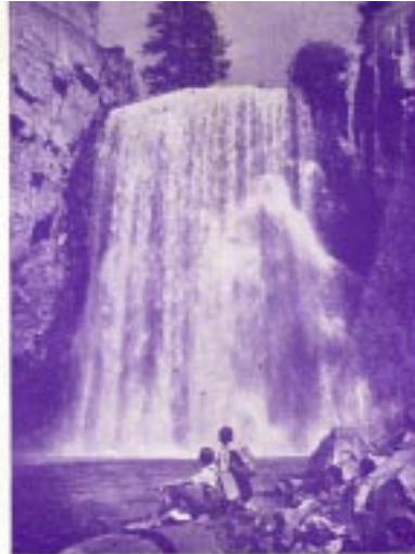
• Rainbow Falls •

Playgrounds —Equipment for camp games and sports— Library —Store.