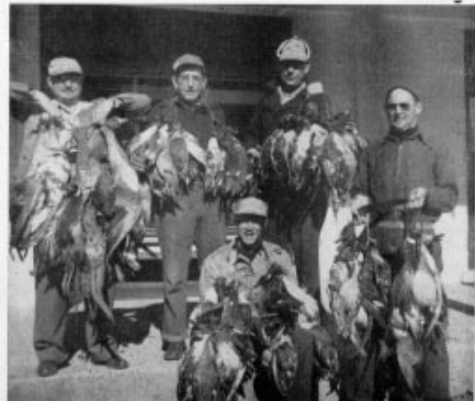
DID YOU SAY HUNTING?—A GROUP OF SANTA MONICA SPORTSMEN WITH A GAY'S BAG.