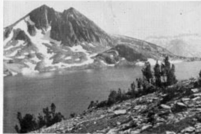
A HIGH SIERRA LAKE—TYPICAL OF MANY THAT YOU FIND WITHIN A DAYS FISHING DISTANCE OF OUR RESORT.