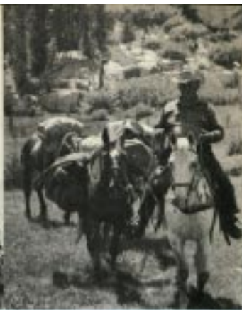
Let's go! What we waiting for?