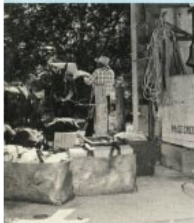
typical scene at the packing shed