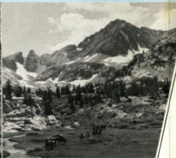
Glaciers of the past carved this perfect vacation spot