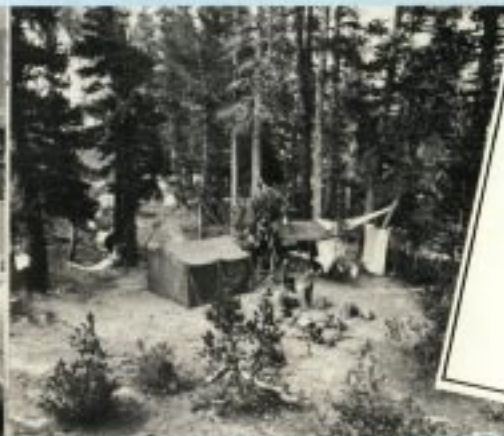
Typical back country camps