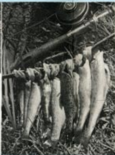
Trout for lunch today