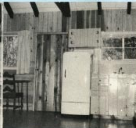
Cabin and bunkrooms for your convenience