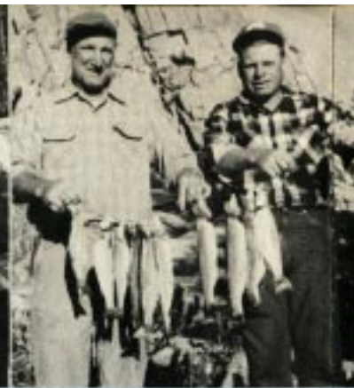
Rainbow and golden from the lakes of Upper Fish Creek