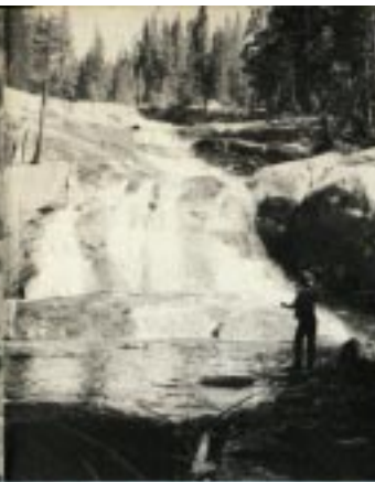
I'm ready - Fish Creek - the finest of stream fishing