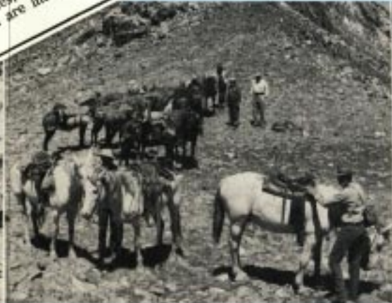
A stop for pictures on the top of McGee Pass