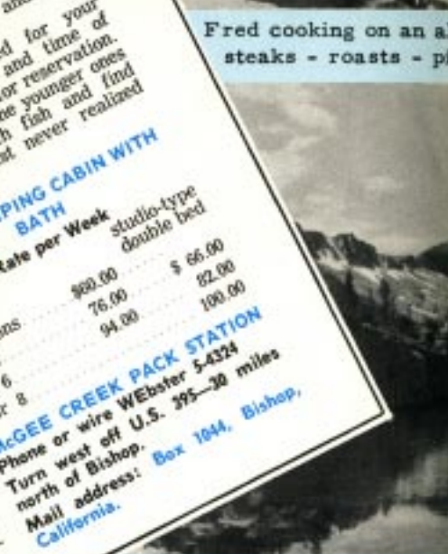
Reflection of multicolor peaks in Upper McGee