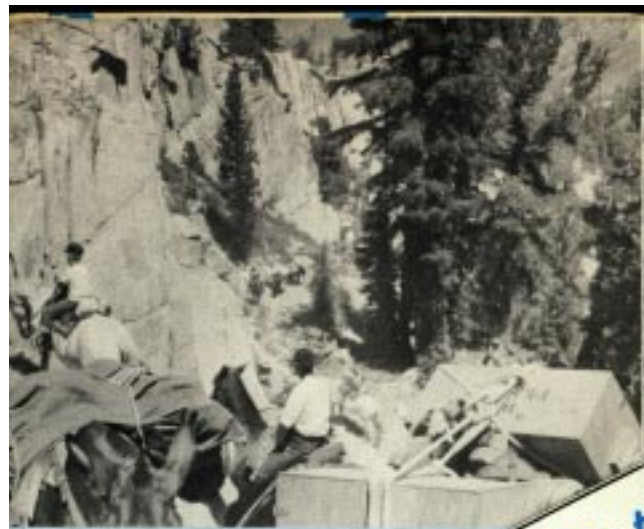
A pack trip has something for everybody