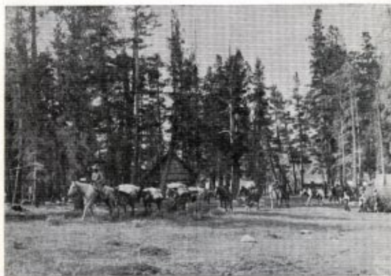
A View of Golden Trout Camp

• THE CAMP has been designed to offer an ideal vacation for those who enjoy the simple comforts of life amidst outdoor surroundings of incomparable grandeur. That the success of this aim has been achieved is evidenced by the increasingly large list of those who return for a visit year after year.