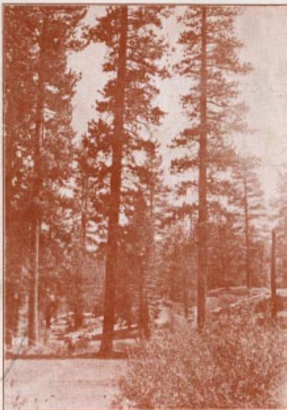
The Murmuring Pines

Best animals and equipment only. Competent guides and packers.