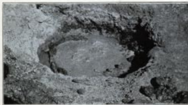
Boiling Blood Red Volcanic Mud